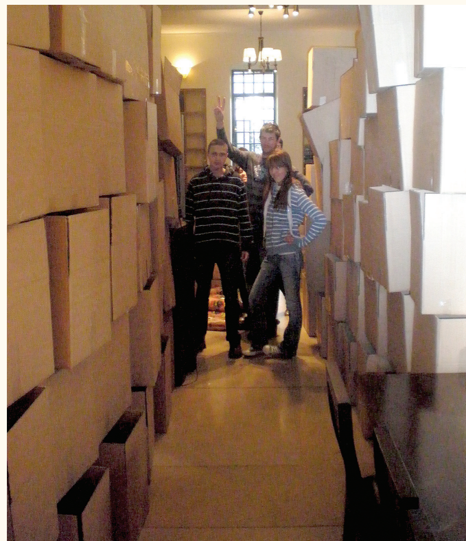
Boxes of supplies were stacked to the ceiling in the Jerusalem Messianic Centre. A team of young people from Australia helped to deliver them to Sderot.