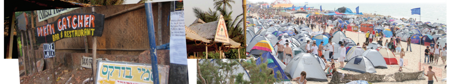
Our staff members go where seekers gather, whether at festivals like the one held in April in Israel (above) or in the Goa region of India (left).

Tranquillizers and pain suppressants work by numbing the senses and masking the pain long enough to give one a momentary sense of relief. The New Age movement and related philosophies work in much the same way. They mask the problem of sin long enough to give their followers a false sense of peace and serenity. While the New Age movement may promise enlightenment, in the end the pay-off is darkness.